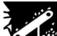
Edentrillick Quarries Ltd Budore Quarries

McQuillan Group recognise that the environment is a central business concern and that our waste collection and transfer facilities, quarrying, road surfacing, demolition and associated activities, products and services have potential Environmental Impacts. We are committed to continual improvement of our environmental performance and aim to minimise our impact on the environment by making it an integral and fundamental part of our business.