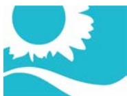
McQuillan Envirocare Ltd