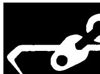
McQuillanSkip Hire Ltd