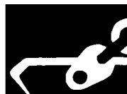
McQuillanSkip Hire Ltd