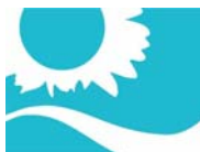
Mc Quillan Envirocare Ltd