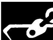
McQuillan Skip Hire Ltd