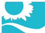
Mc Quillan Envirocare Ltd